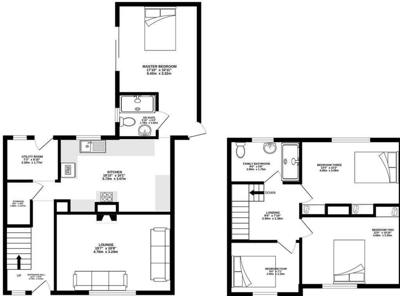
TOTAL FLOOR AREA : 1110 sq.ft. (103.1 sq.m.) approx.

Whilst every attempt has been made to ensure the accuracy of the floorplan contained here, measurements of doors, windows, rooms and any other items are approximate and no responsibility is taken for any error, omission or mis-statement. This plan is for illustrative purposes only and should be used as such by any prospective purchaser. The services, systems and appliances shown have not been tested and no guarantee as to their operability or efficiency can be given. Made with Metropix ©2026